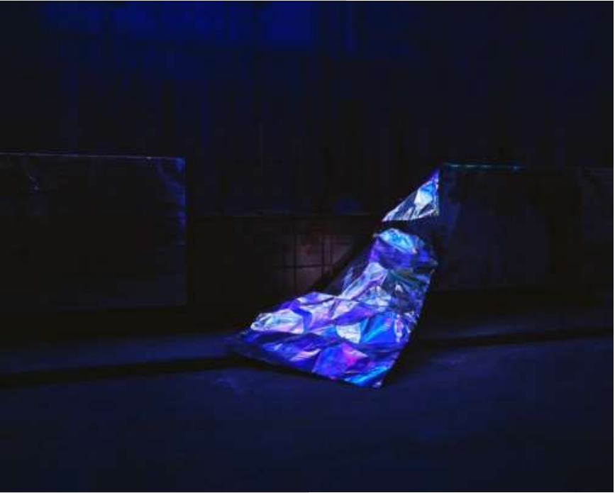
铁皮 | An Iron Sheet | 2015 150x187.5cm | 摄影 | 收藏级喷墨打印 | Photograph | Archival Inkjet Print | Ed. 6