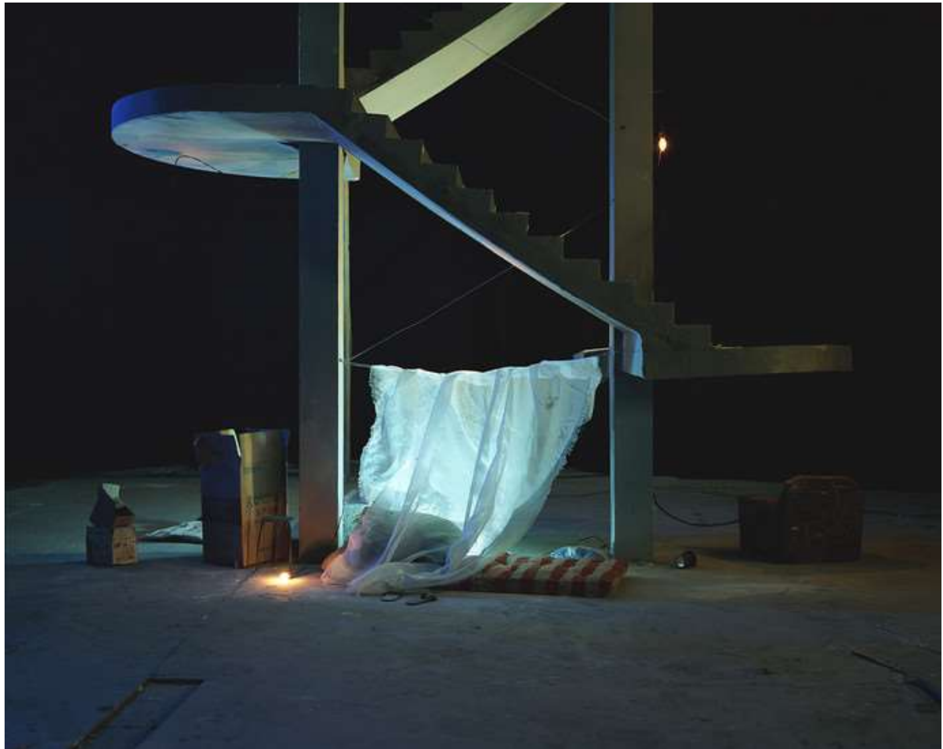
一居室 | One-Bedroom | 2014 80x60cm | 摄影 | 收藏级喷墨打印 | Photograph | Archival Inkjet Print | Ed. 6