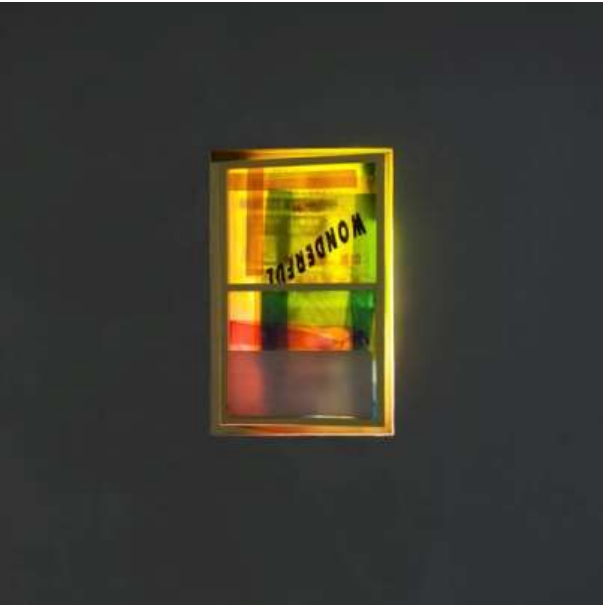
万德福 | Wonderful | 2017 100x100cm | 摄影 | 收藏级喷墨打印 | Archival Inkjet Print | Ed. 6